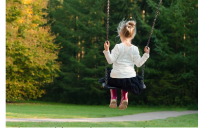
as our reminder to Pray for families