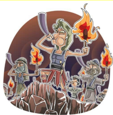
Photo: God Gives Gideon Victory

By this time, it was 8:50am so I thought it best to wrap and pray. We gathered around the man and began to pray for him, binding spirits of addiction and anger. We were louder than usual as all the men were praying. We finished and, visibly moved, he got up, and said that he felt something leave him. That opened the floodgates, so we prayed for each of the men – binding spirits of addiction, anger, rejection, pornography, etc. I prayed to bind the spirit of religion